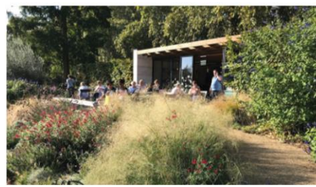
To be surrounded by trees and planting