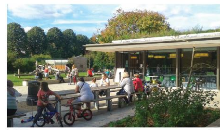
Outdoor seating space overlooking playground