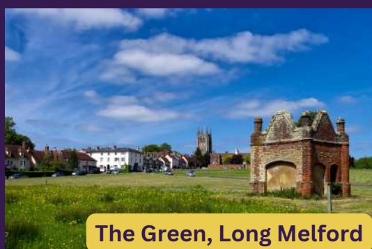
The Green, Long Melford