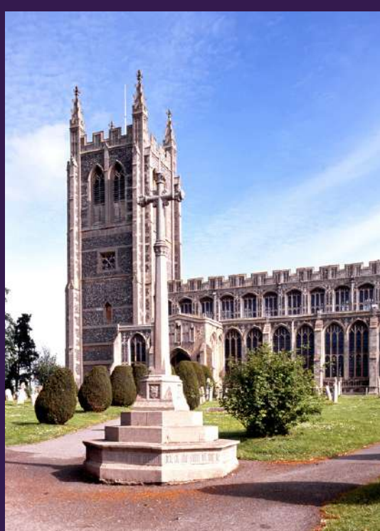
Holy Trinity Church, Long Melford