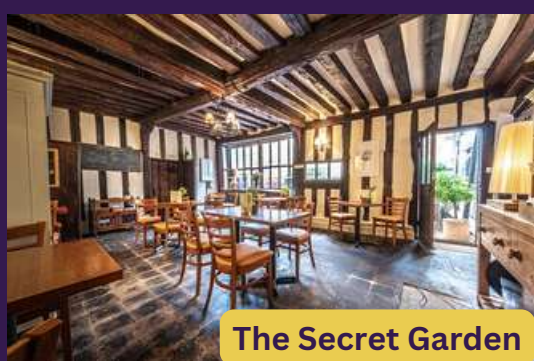
The Secret Garden